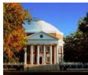
The UVA Rotunda