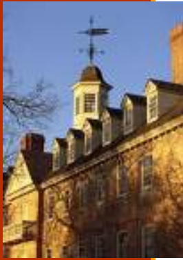
The College of William and Mary